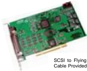
SCSI to Flying Lead Cable Provided