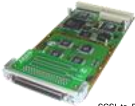
SCSI to Flying Lead Cable Provided