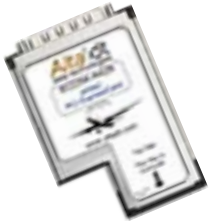
Rugged, Thumb-Screw Connector to Flying Cable Included